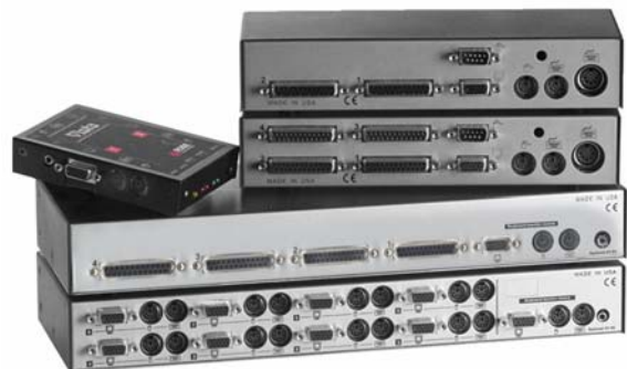
Rear view of Vista models KVL-8PCA, KVL4UA, KVT-2PC, KVM-4UPH, KVM-2UPH