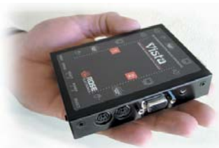
Vista-mini has Hi resolution video and stereo audio

Call us for more information on this excellent family of full-featured, easy-to-use, and economical KVM switches.